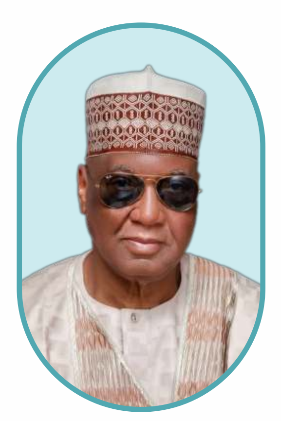
Col. Sani Bello (Rtd.) Former Governor of Kano State